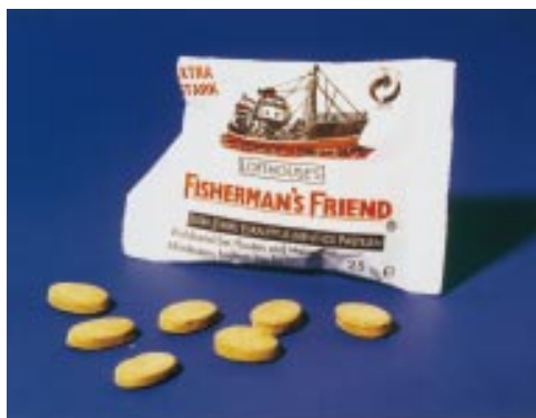
Figure 2 "Fisherman's Friend": a popular brand of strong liquorice candies manufactured in the UK.