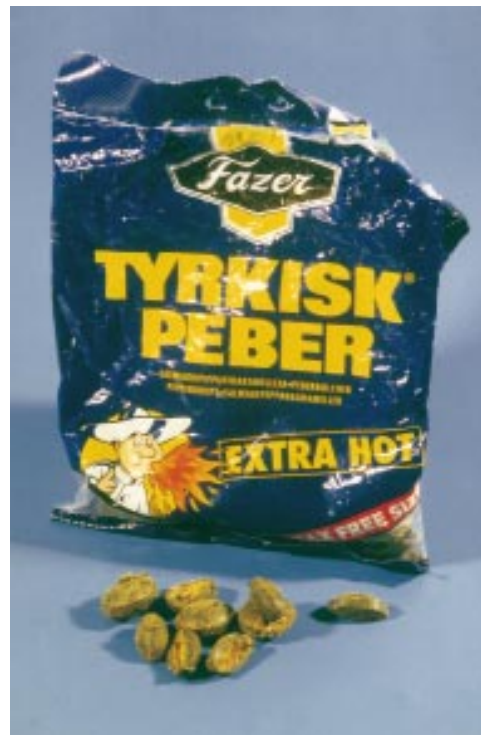
Figure 1 "Turkish Pepper": a strong brand of liquorice candies manufactured in Finland.

Further inquiries revealed daily consumption of large amounts of "Turkish Pepper" (Karl Fazer Ltd, Helsinki, Finland, fig 1), a brand of liquorice candies containing 200 mg glycyrrhizic acid and 1.5 g of sodium/100 g. Moreover, to our astonishment, the patient was incidentally seen ingesting "Fisherman's Friend" (Lofthouse Ltd, Fleetwood, UK, fig 2) liquorice lozenges containing 200 mg glycyrrhizic acid and 60 mg sodium chloride/100 g.